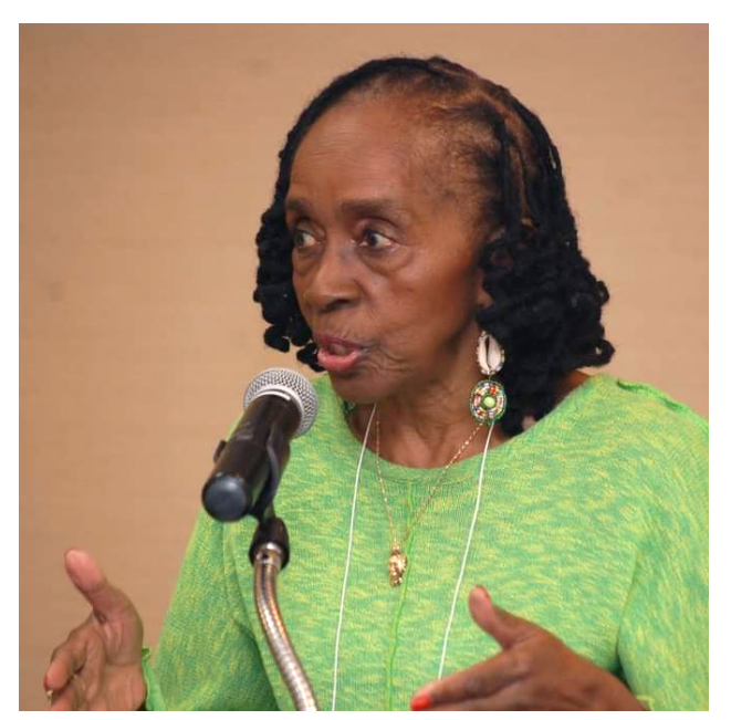
Dr. La Francis Rodgers-Rose speaks at the International Black Women's Congress (IBWC) Annual Conference, Virginia Beach, VA

Afrocentric Education " (Rodgers-Rose, 1991), Rodgers-Rose's ideas about institutional space and the creation of the good and just social order are explored. The struggle to reshape and re-center African consciousness is the key struggle to create a meaningful Black liberation. "As a group, Blacks must become conscious of who we are, committed to changing their structural position, and culturally grounded in the history and world historical struggle of their people; Black as the most progressive force for justice in this country; Black as a people who though continually pronounced dead, called finished, have risen again and again from the ashes to shake not just this country, but as the Black national Anthem states Earth and heaven ring in our push for freedom" (Rodgers-Rose, 2001).